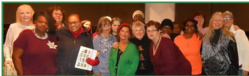
WVI Members