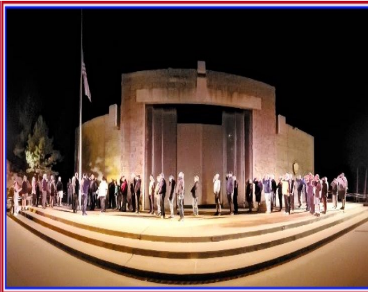
Mt. Rushmore - Veterans